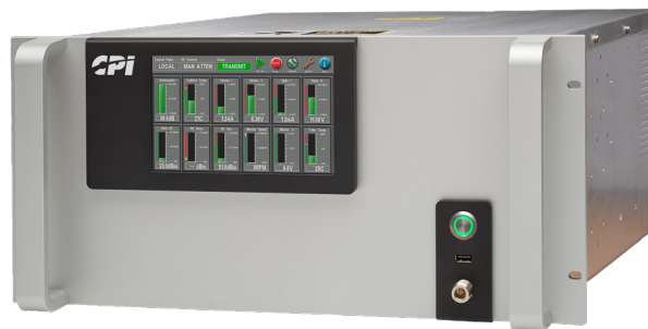
CPI 750 W DBS-band TWTA, Model T5DI